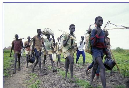
Some of the Lost Boys of Sudan

The YAC Class Trinity Episcopal Church 36 Main Street Newtown, CT 06470 203 426-9070 www.TrinityNewtownCT.org